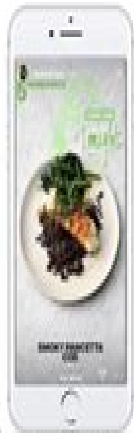
Facebook Stories (Mobile)