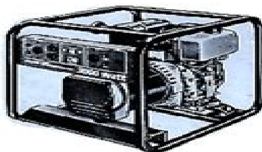
Figure 1 – Model 32C06B

Dayton professional-duty generators are rugged and compact. These models provide dependable, trouble-free service. The alternators are brushless with revolving fields. V-twin diesel engines provide long life under heavy use. These engines are governed to maintain engine speed of 3600 RPM under load. 3600 RPM engine speed provides 120/240V, 60 Hz power. Additional features include circuit breaker protection, spark-arresting muffler, large fuel tank, oil alert system (model 4W315B only), electric starter (model 4W315B only), and a pressurized lubrication system.