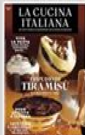
La Cucina Italiana - Germany 2011