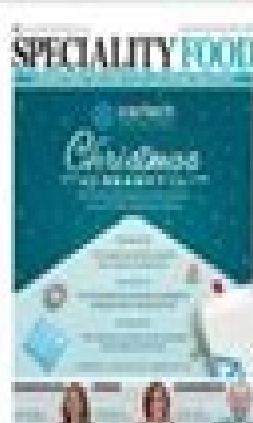
Speciality Food - November- December 2012