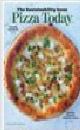
Pizza Today - November 2012