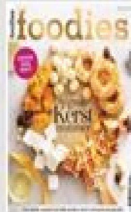
Foodies Netherlands - december 2012