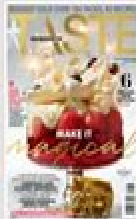
Woodworths Taste - November 2012