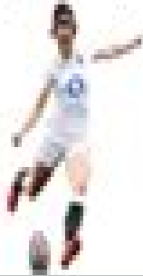
Well Being & Lifestyle Choices