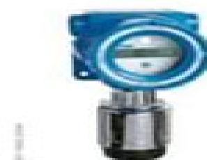
Dräger Polytron 2 XP Tox Electrochemical sensor to detect toxic gases and oxygen.