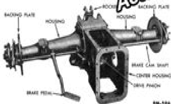
Fig. 32—Rear Axle Assembly

Lift the axle shafts from the axle housing. Remove the cap screws that secure the left-hand axle housing to the center housing, and remove the axle housing. Lift the differential from the center housing (fig. 35). Remove the right-hand axle housing from the center housing.