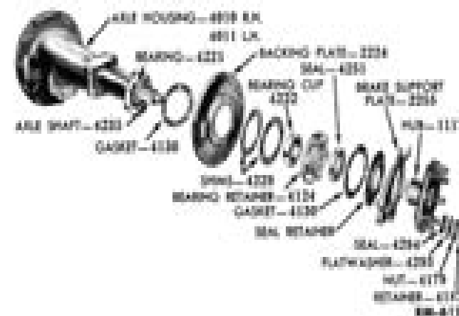
Fig. 34—Backing Plate and Hub, Disassembled

Place the axle shaft assembly on a bench, and remove the lock ring that secures the axle shaft nut. Remove the axle shaft nut, flat washer, and seal. Remove the cap screws that secure the differential gear case to the axle shaft housing. Separate the two halves. If necessary, use a hammer to tap the two halves apart. Remove the differential spider, together with the differential pinions and thrust washers, from the differential gear case (fig. 35). Remove the differential side gears and thrust washers.