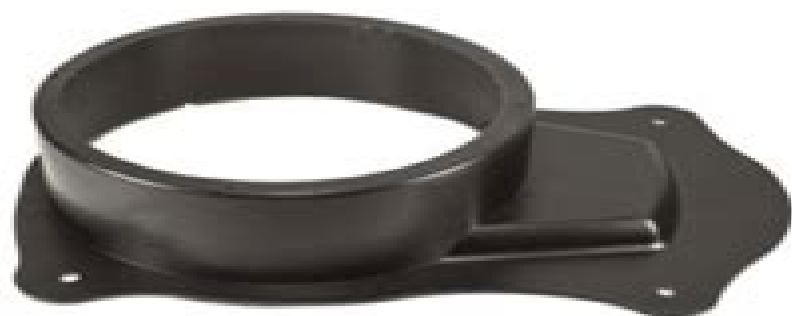
2x LSR FORD2