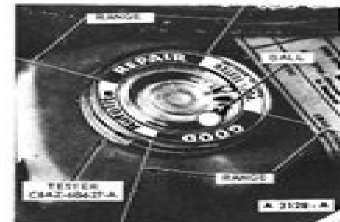
FIG. 4—Crankcase Ventilation System Tester—Typical

If the loping or rough idle condition remains when the good regulator valve is installed, the crankcase ventilation regulator valve is not at fault.