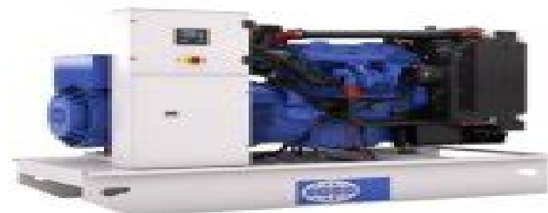
Imagen con finalidad ilustrativa únicamente