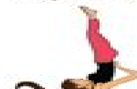
SHOULDER STAND Le Chendelle