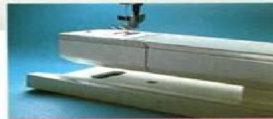
FREE ARM Converts to two sizes. I use the standard