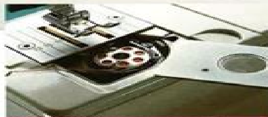
DROP-IN BOBBIN No bobbin case. The bobbin is