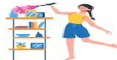
organize a bookshelf