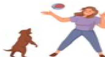
play with your pet