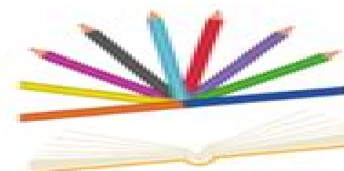
use an adult coloring book