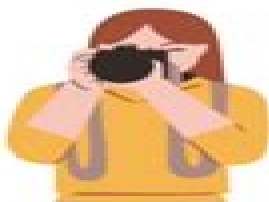
do a photoshoot