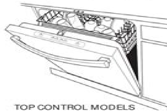
TOP CONTROL MODELS

Write the model and serial numbers here: