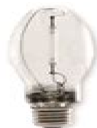
ED17 MEDIUM BASE LU50/MED LU70/MED LU100/MED