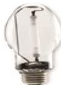
ED23.5 MOGUL BASE LU50/MOG LU100/MOG LU150/MOG