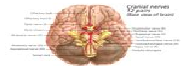
Cranial nerves 12 pairs (Base view of brain)