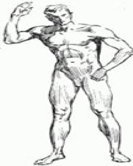
THEN BUILD YOUR FIGURE