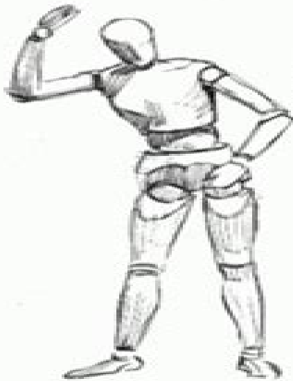
SKETCH THE MANNIKIN