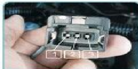
Terminal elétrico do sensor CKP