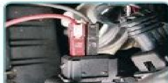
F.2.1 - Procedimento de medida de resistência do sensor CKP