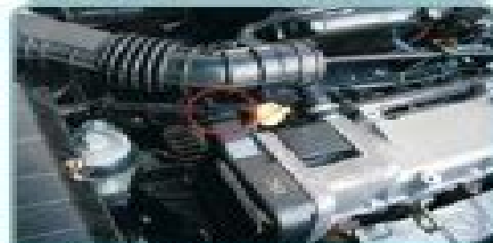
Localização do terminal elétrico do sensor CKP

Aproximadamente 1,8 [Vac]. A tensão de resposta varia em função da velocidade do motor de partida (depende da carga da bateria).