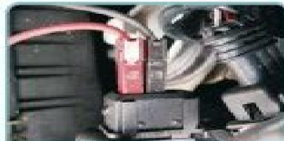
F.1.1 - Procedimento de medida de tensão de resposta do sensor CKP