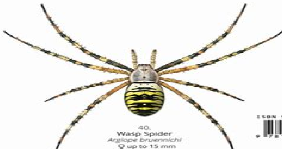
40. Wasp Spider Argiope bruennichi ♀ up to 15 mm