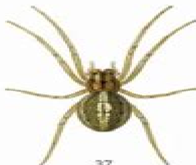
37. Long-jawed Orbweb Spider Pachygnatha clercki 6 mm