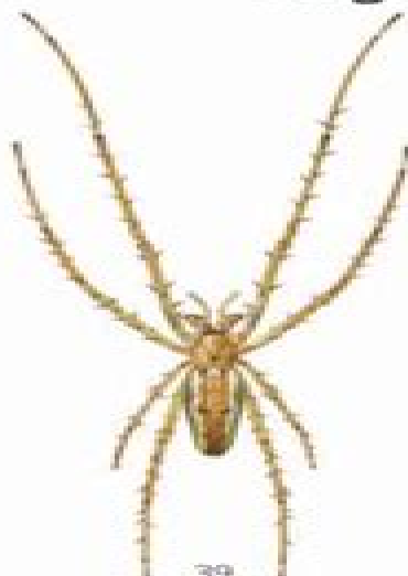
39. Long-jawed Orbweb Spider Tetragnatha montana ♀ 10 mm