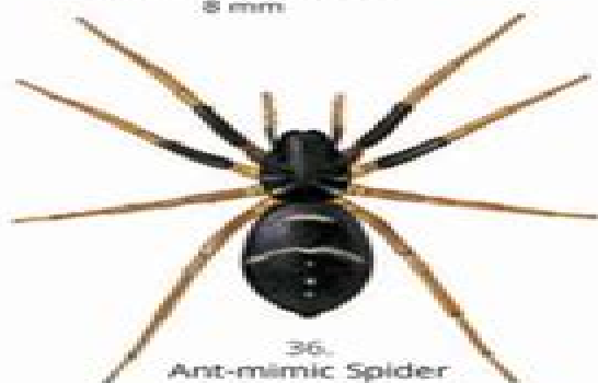
36. Ant-mimic Spider Micaria pulicaria ♀ 4 mm