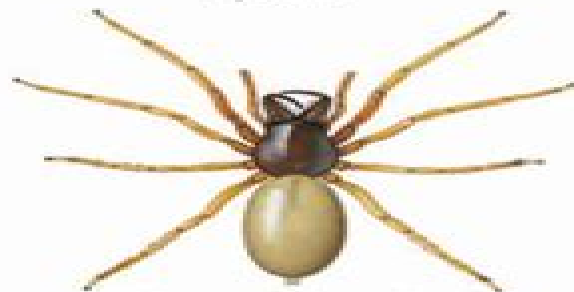
38. Woodlouse Spider Dysdera crocata ♀ 12 mm