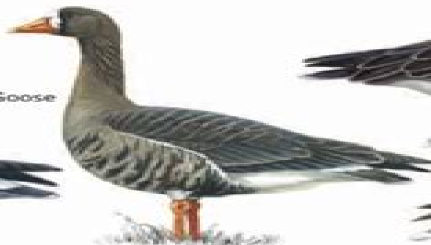
Greenland form (spp. flavirostris)