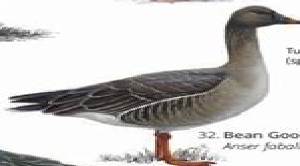
Tundra form (spp. rossicus)