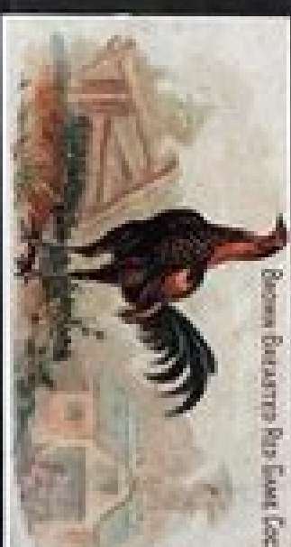
Brown Bearded Red Game Cock.