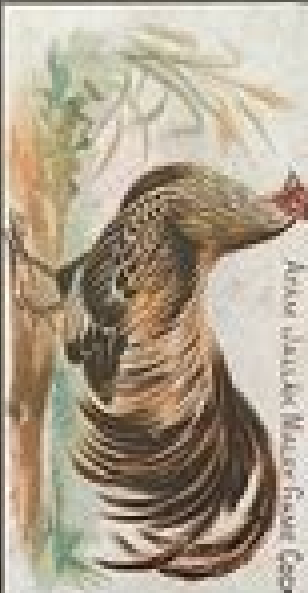
Blue Shaded Game Fowl.