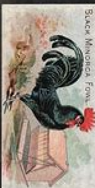
Black Minorca Fowl.