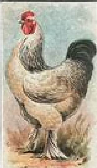
AMERICAN LIGHT BRAHMA.