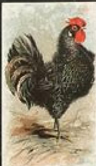
BLACK FRIZZLED FOWL.