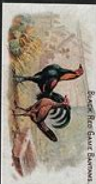
Black Red Game Bantam.