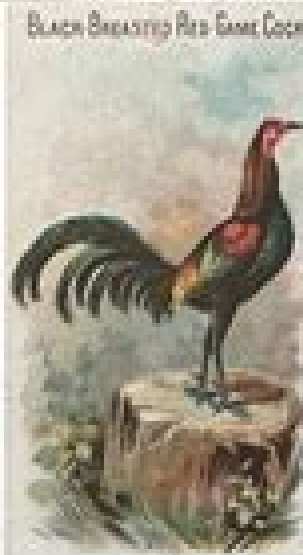
Black Breasted Red Game Cock.