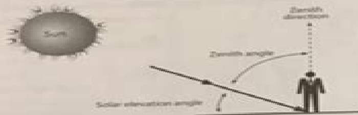
Figure 2-5. Defining angles.

Since we can assume that the Sun's rays strike Earth in straight, parallel paths, we see that the zenith angle of any location is the same as the number of degrees separating the location and the place receiving direct solar rays. Notice in Figure 2-6 that the zenith angle A at 40^\circ N is the same as the latitude difference between 40^\circ N and the subsolar point (where the Sun's rays strike directly — 23.5^\circ S here).