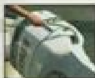
A freshwater flushing port lets you flush corrosion particles from the engine without leaving the boat.

keystone piston rings. Our closed-deck powerhead, finger port cylinder sleeves and Power Path™ induction system are all designed to maximize both power and fuel economy. Offshore boating demands a higher standard of performance from outboards, so should you. Evinrude OceanPro™ outboards.