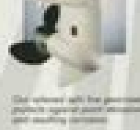
Our closed-deck powerhead, finger port cylinder sleeves and Power Path™ induction system are all designed to maximize both power and fuel economy.