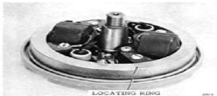
Figure 4-15. Coil Locating Ring