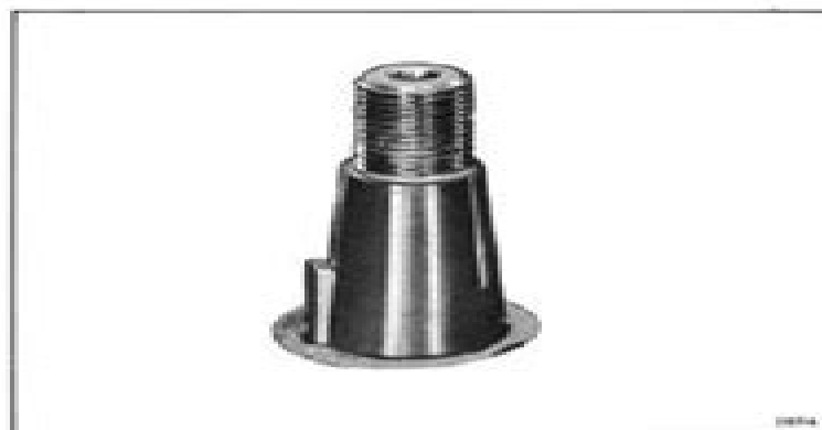
Figure 4-17. Flywheel Key Position

b. Install cam, making certain that side marked "TOP" is up. See Figure 4-18.