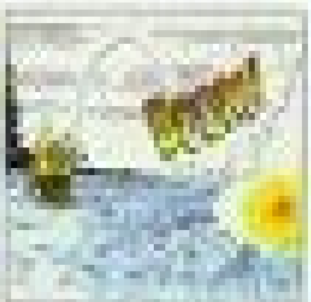
NETS: Nylon, 10' x 12' x 18" $29.95