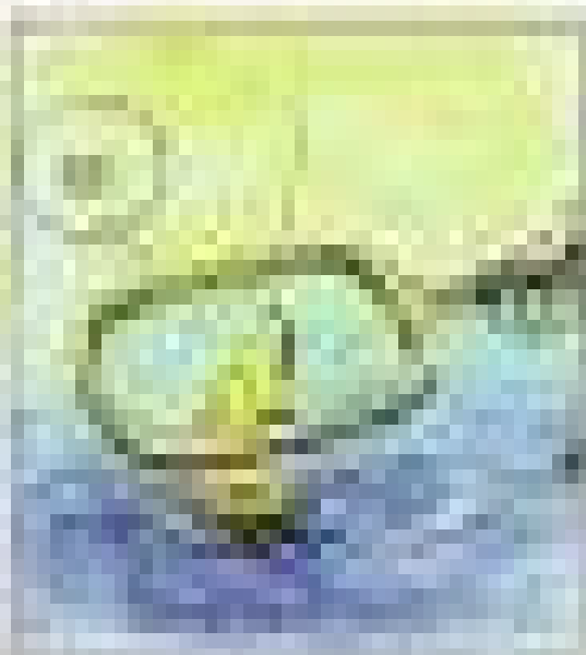
NETS: Nylon, 10' x 12' x 18" $29.95