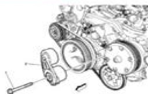
Fig. 11. Drive Belt System - Assembly Courtesy of GM Global, Information & Technology

DRIVE BELT TENSIONING REPAIRS AND ADJUSTMENTS - 4000000000