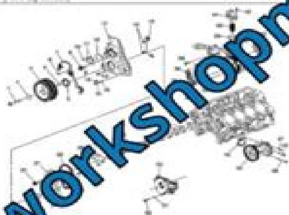
Fig. 9. Exploded View OCV (Oil Control Valve) System