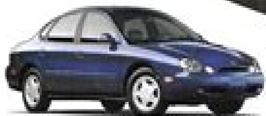
Some 1.8 liter does is Roughly the Greatly.

The design is an automotive tour de force. A simplicity of lines. On the road, it's a true eye catcher. But Tercel is more than just a pretty face. It has established itself as a car that delivers safety, room, comfort, performance and driver reward. A car praised by critics and owners alike.