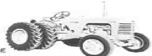
INDUSTRIAL DUAL REAR WHEELS