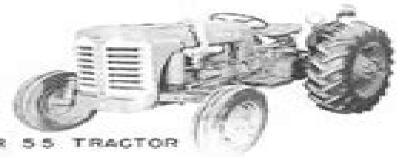
SUPER 55 TRACTOR