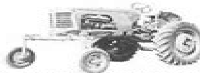
ROW CROP EXTRA HIGH CLEARANCE