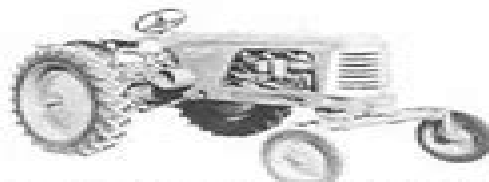
ROW CROP ADJUSTABLE FRONT AXLE