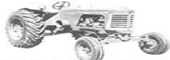
ROW CROP STANDARD FRONT AXLE