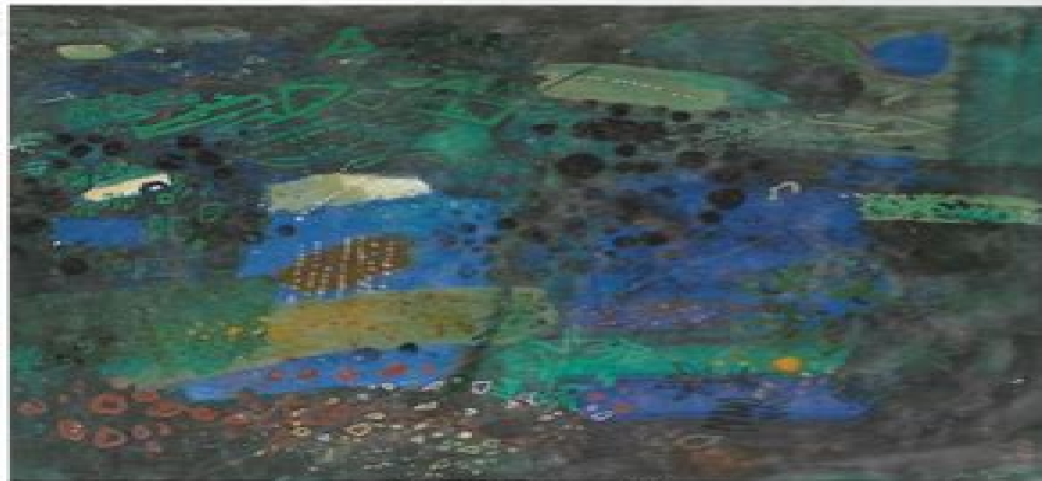
John Piper, Landscape, 1991

IN ASSOCIATION WITH THE ROYAL ACADEMY OF ARTS