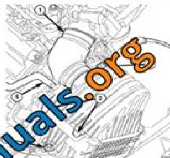
Fig. 44: Removing/Installing Stretch To Fit Power Steering Belt

Disconnect electrical connector (if equipped).