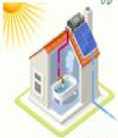
Solar Electricity Energy