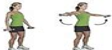
STANDING SIDE RAISE