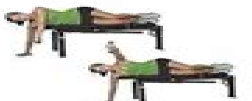
LYING SINGLE ARM FLYES