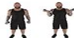
STANDING BICEP CURL