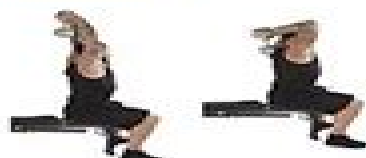
SEATED TRICEPS PRESS