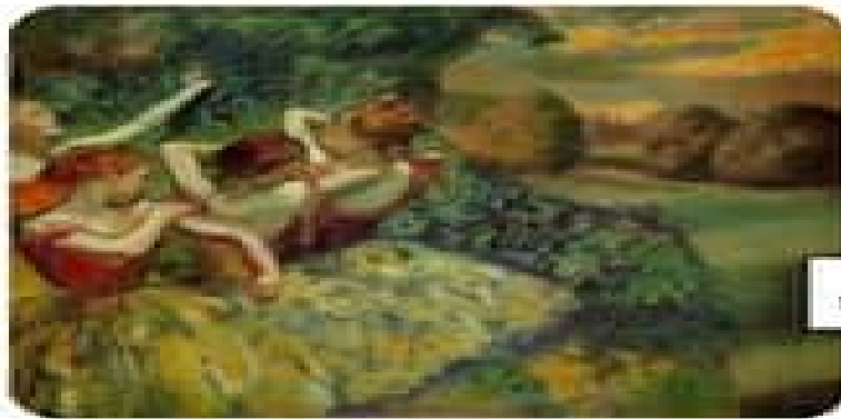
Four Dancers by, Edgar Degas 1890