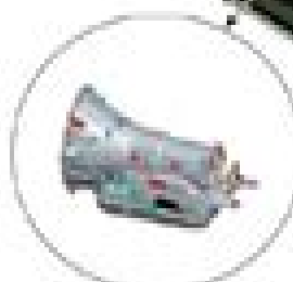
Automatic transmission number (ATF#, ABL#, etc.)