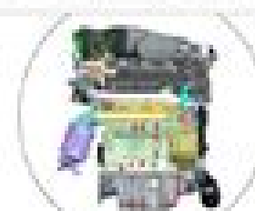
Engine number (like 5.0 DCI Gasoline)