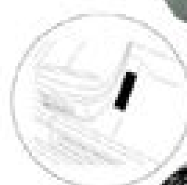
Vehicle identification number