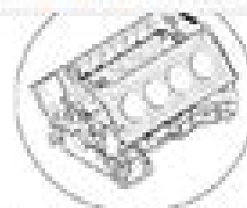
Engine number (like 5.0 DCI Gasoline)