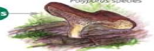
Polypore Polyporus species

Still not found it? Don't worry! Try looking for it in a book from 'Further reading' overleaf.