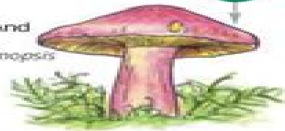
Plums And Custard Tricholomopsis rutilans

Is it white and growing on a beech tree?