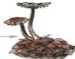
Earpick Fungus Auriscalpium vulgare