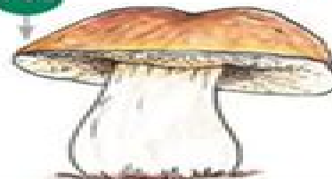
Penny Bun Boletus edulis (or one of its many relatives)

Is it growing on wood? It will have gills under the cap