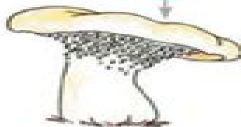
Wood Hedgehog Hydnum repandum