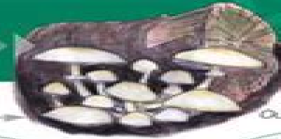
Porcelain Fungus Gudermannia mucida