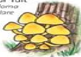
Sulphur Tuft Hypholoma fasciculare