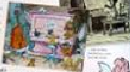
The cat who was a cat lover.

On the way, they met a man who was a cat lover.