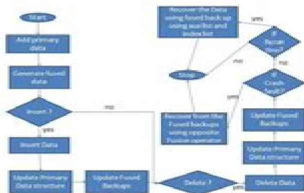
Fig. 1 = architecture of system