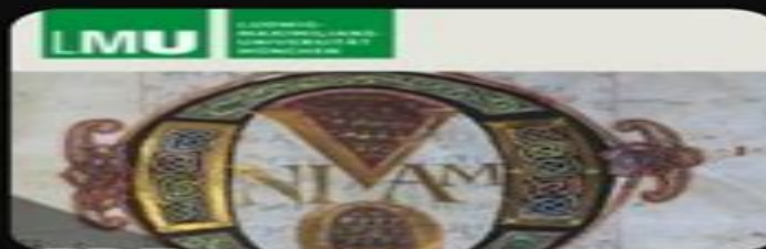
Keimelion - Schätze des... Arts