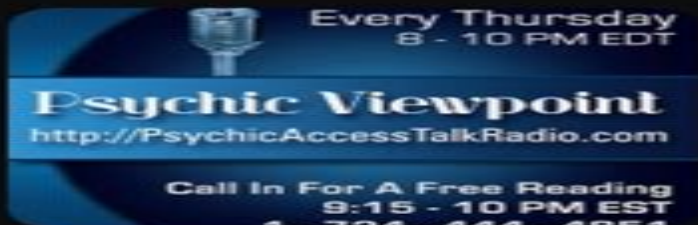
Psychic Viewpoint Religion & Spirituality