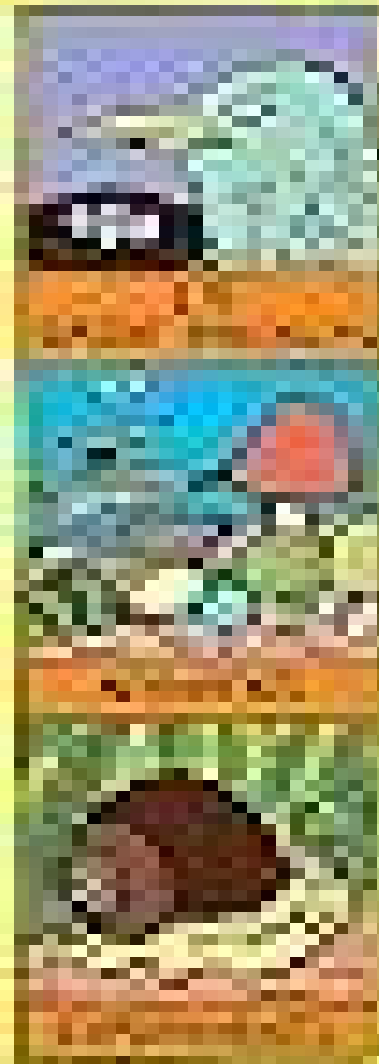
ILLUSTRATION BY JIMMY