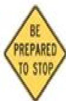
Be Prepared to Stop sign