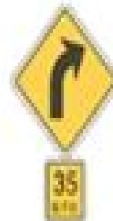
Advisory Speed Around Curve sign