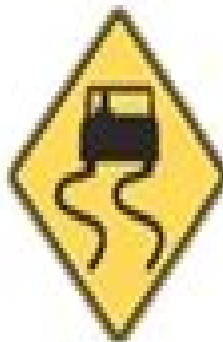
Slippery When Wet sign