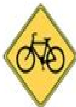
Bicycle Crossing sign