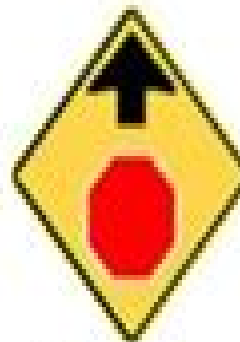
Stop Sign Ahead sign