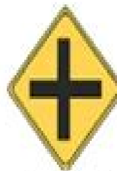
Cross Road Ahead sign